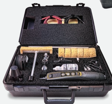
Complete Kit shown